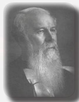
John Charles Ryle (1816-1900)

J.C. Ryle began his service to the Lord as a minister of the gospel in parish churches within the Church of England, for almost forty years. He then became Bishop of Liverpool in 1880, and came to international prominence as preacher, Bible expositor, and author.