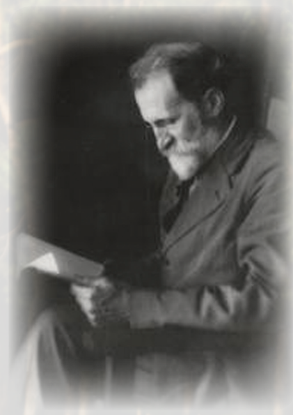
Samuel Logan Brengle (1860–1936)

My idols I cast at Thy feet, My all I return Thee who gave; This moment the work is complete, For Thou art almighty to save. O Saviour, I dare to believe, Thy blood for my cleansing I see; And, asking in faith, I receive Salvation, Full, present, and free.