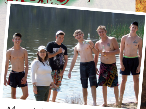
Me with some of the boys

I then continued to speak to them about death, the law, sin and judgment and then was able, amongst some heck-ling, to explain the Good News of salva-