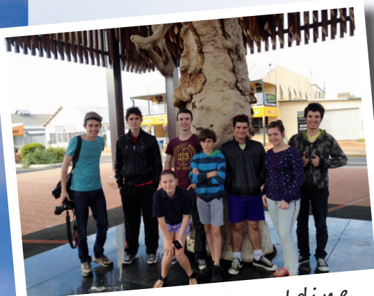
The team in Barcaldine

D uring the Winter School Holidays in 2012, a group of young people from Peace Apostolic Community in Rockhampton, Qld decided to visit outback towns in Central Queensland and share the gospel with tracts they wrote themselves.