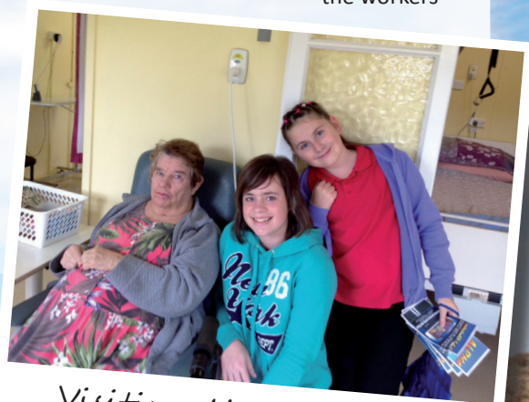
Visiting Alpha Hospital